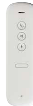
Inner view of the handset