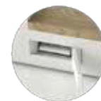
USB port for smartphone charging